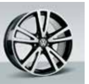
17" Vision wheel