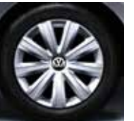
15" wheel with full wheel cover TL and TL+

* Available with 2.5L and TDI models only.