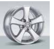
16" Sima wheel