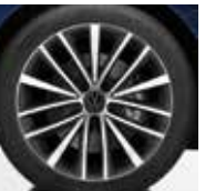
17" Queensland alloy wheel SL and HL