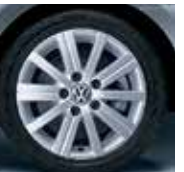
15" Wellington alloy wheel CL 2.0L