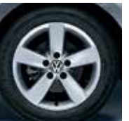
16" Mamba alloy wheel CL