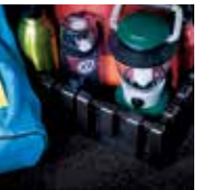
CarGo trunk liner and CarGo blocks