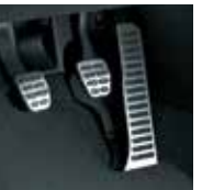
Aluminum pedal covers