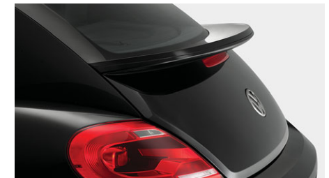
Rear Hatch Spoiler