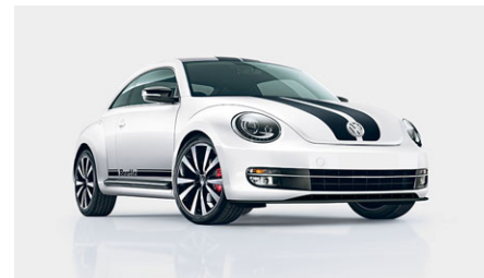
Body Styling Kit