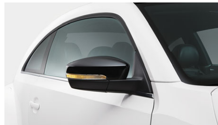
Black Mirror Caps