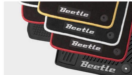
MojoMats® and Monster Mats®