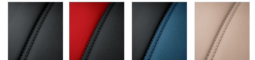
Titan Black Black/Red Black/Blue Beige