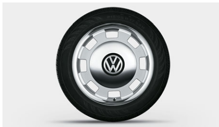
17" Heritage Wheel and Center Cap

To see more accessories for your VW, visit www.parts.vw.com or see your Consultant.