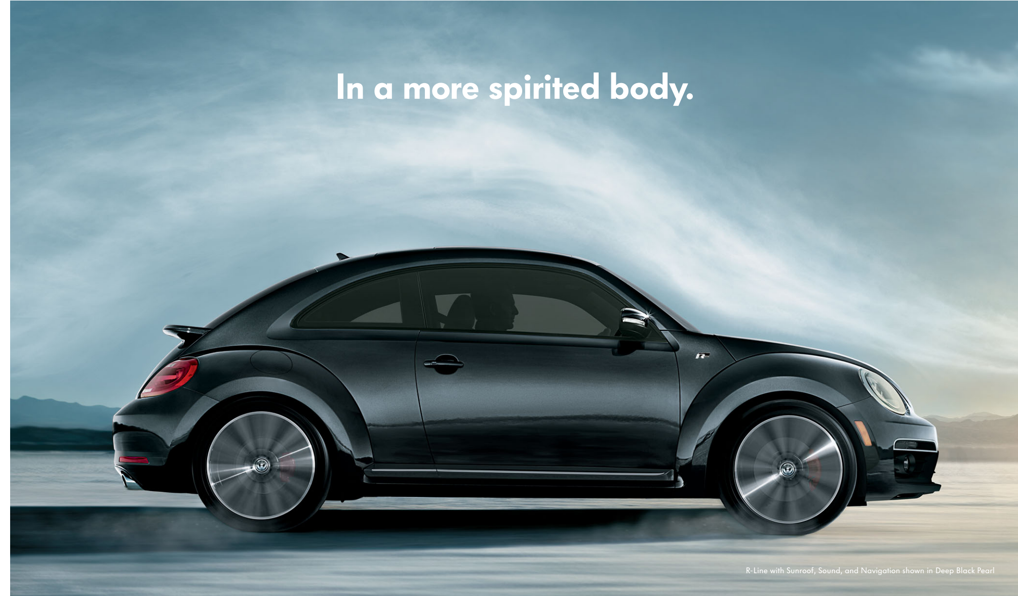
R-Line with Sunroof, Sound, and Navigation shown in Deep Black Pearl

Design/Performance. You know the shape once you see it. That unforgettable profile. Those classic headlights. It's new and familiar all at the same time. With more sculpted lines, available red brake calipers, and a sporty, leather-wrapped steering wheel, this Beetle hits on all cylinders before you even hit the road. It wants to take on the next straightaway. It wants to take on every curve.* It wants you in the driver's seat.