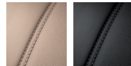
Beige Titan Black