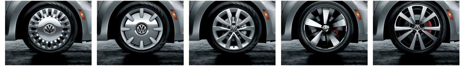
17" Turbine 18" Disc 17" Rotor 18" Twister 19" Tornado