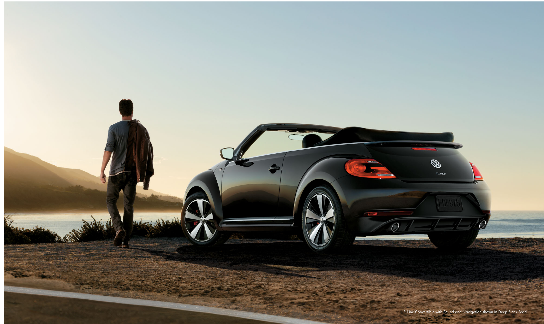
R-Line Convertible with Sound and Navigation shown in Deep Black Pearl

Bi-Xenon headlights. Brighter than traditional halogen headlights, ours are framed by a distinctive row of LEDs for a modern take on a classic look. The entire package is designed to help you see. And be seen.*