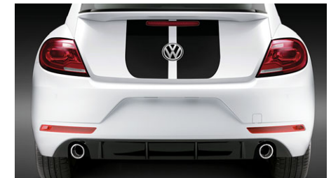
Custom Vehicle Graphics