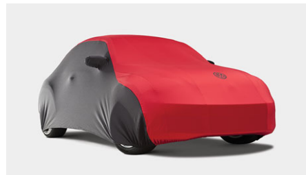
Custom Car Covers*