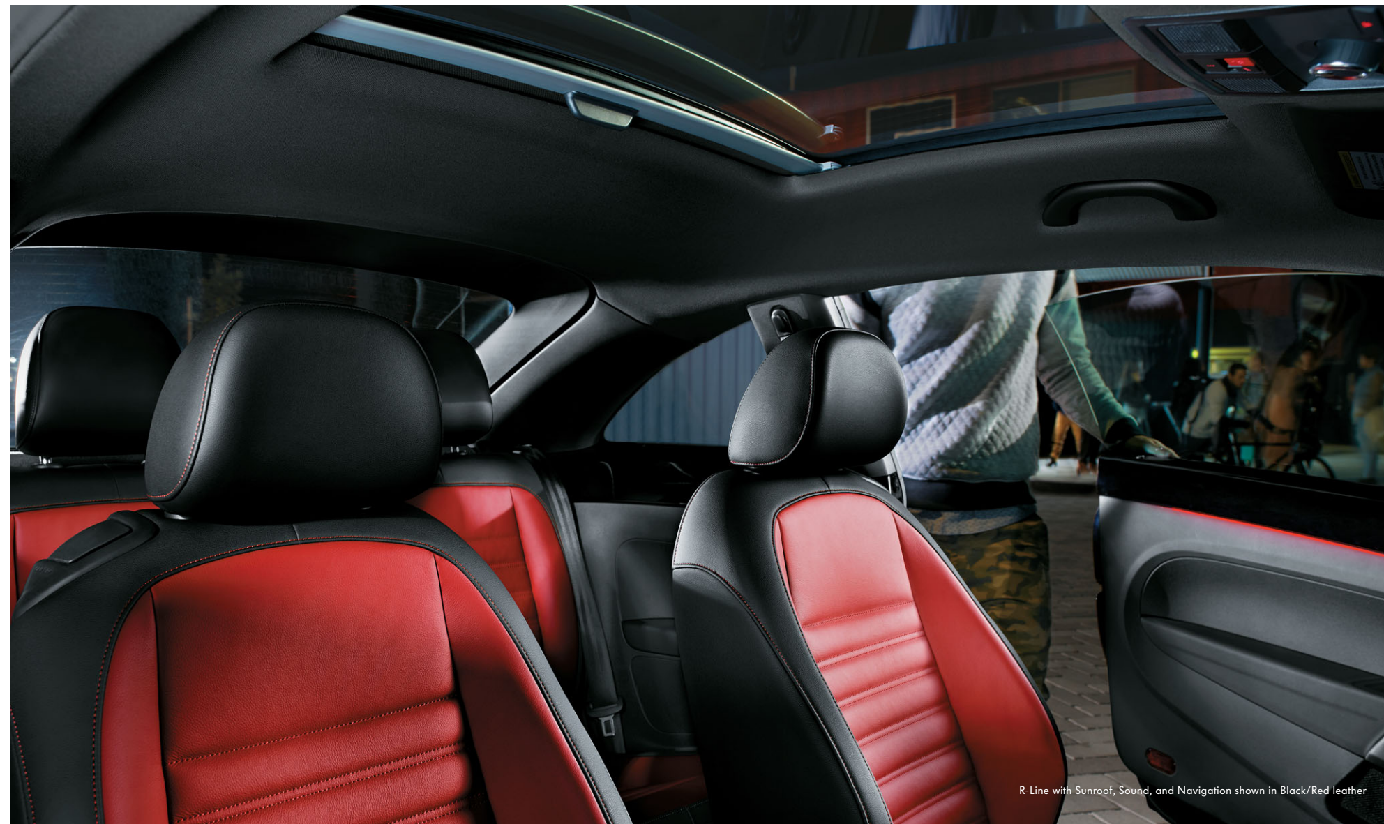
R-Line with Sunroof, Sound, and Navigation shown in Black/Red Leather

*Always obey local speed and traffic laws.