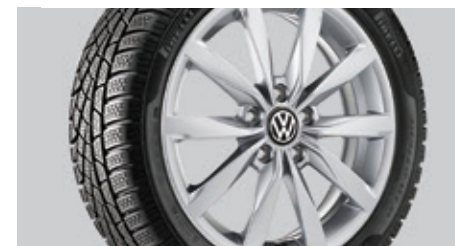
17" Tronic alloy wheel