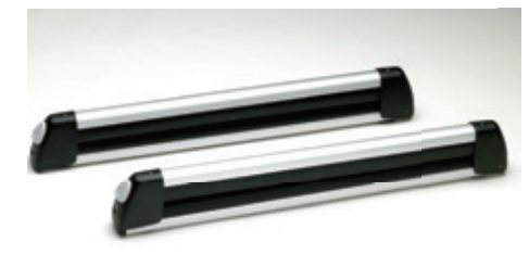
Base carrier bars and snowboard/ski attachment