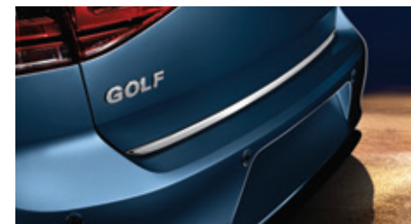
Chrome rear accent strip