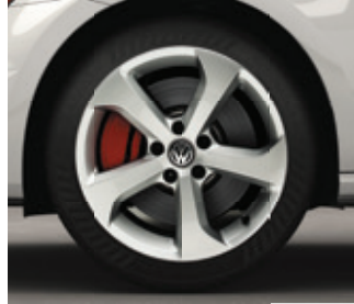
17" Brooklyn alloy wheel 3D