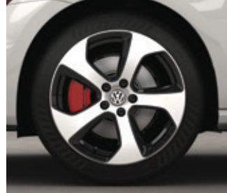
18" Austin alloy wheel 3A/3PF/5A/5PF