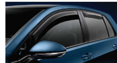
Side window deflectors