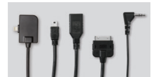
USB to Apple® Lightning connector

Select accessories shown on 2015 Golf but are available for and compatible with the 2016 Golf GTI.