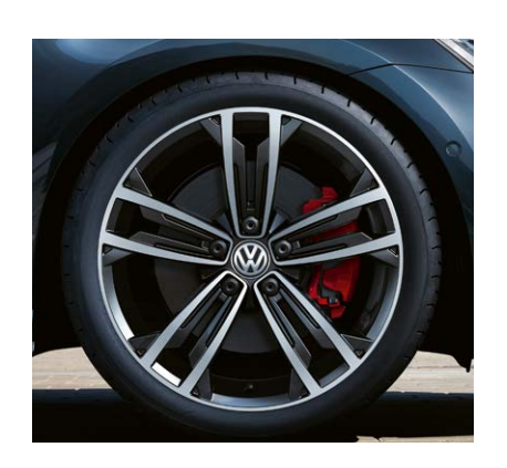
18" "Sevilla" Alloy (Standard on GTD)