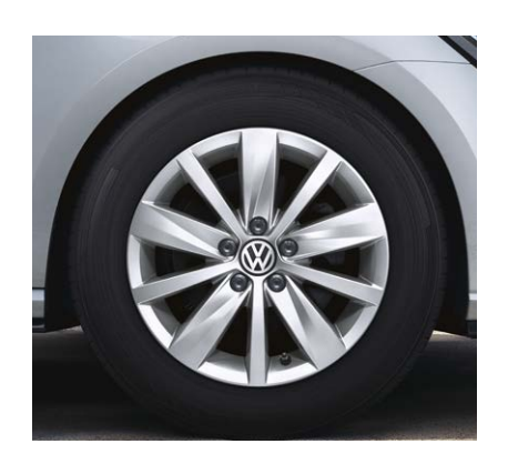
15" "Lyon" Alloy (Standard on Trendline)