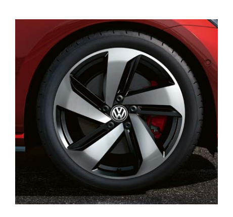
18" "Milton Keynes" Alloy (Standard on GTI)