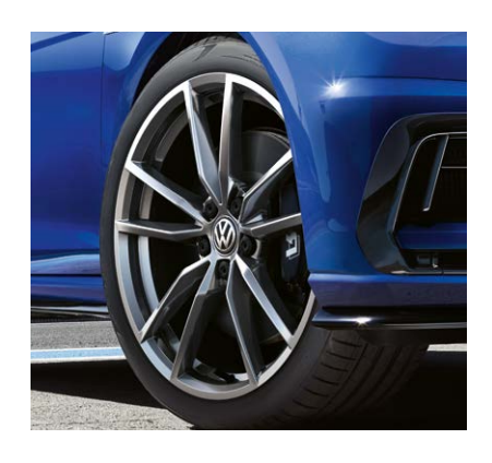
19" "Pretoria" Alloy (Optional on R)