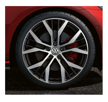
19" "Santiago" Alloy (Optional on GTI)