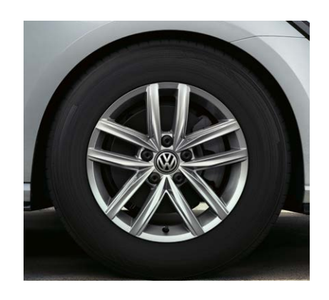
16" "Hita" Alloy (Standard on Comfortline)