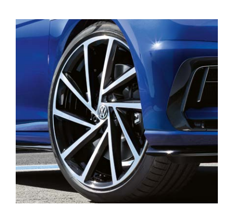
19" "Spielberg" Alloy (Standard on R)