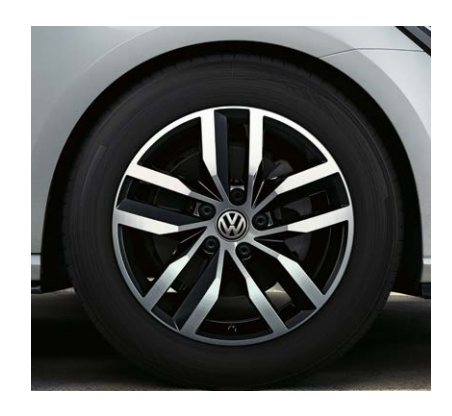
17" "Madrid" Alloy (With R-line Exterior)