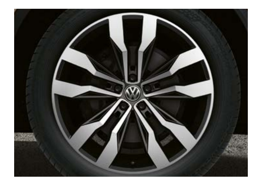
"Suzuka" 21" Alloy (Optional on Executive)