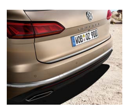
Loading lip protection Transparent