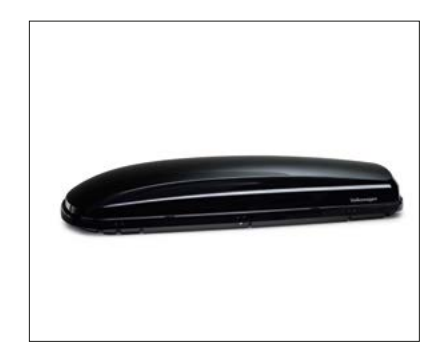
Roof box Comfort, 340 litres, high-gloss black