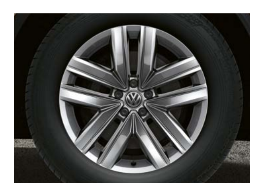
"Esperance" 19" Alloy (Standard on Luxury)