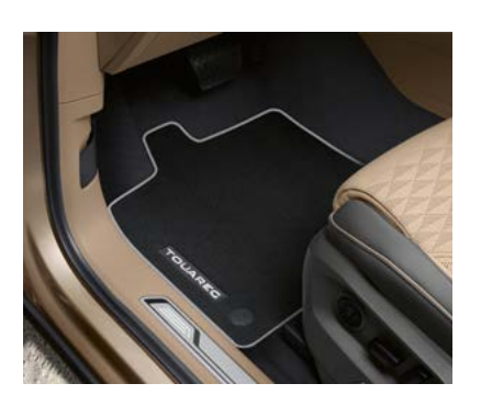
Textile footmats Premium