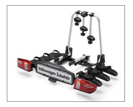
Bicycle carrier for the towing hitch 3 bicycles, folding, Compact III