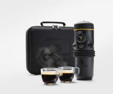
Espresso maker 12V on-board power operation