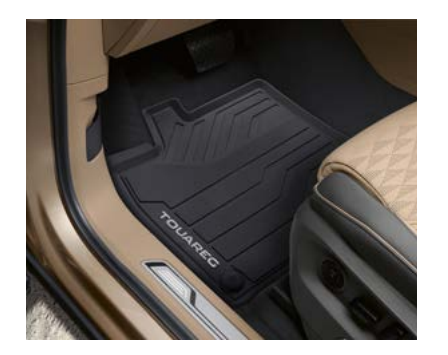
All-weather floormat set Front + rear