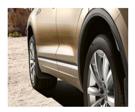
Mud flap Front