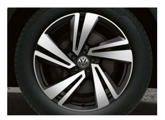
"Nevada" 20" Alloy (Optional on the Luxury model when the R-Line Package is selected)