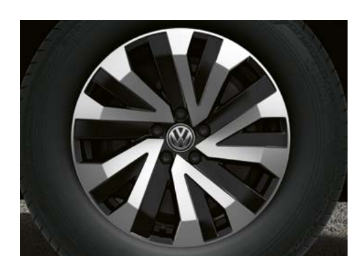
"Concordia" 18" Alloy (Optional on Luxury)