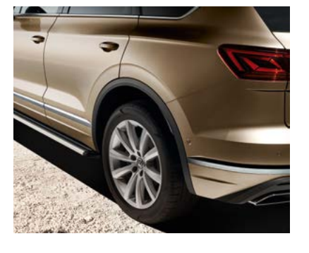
Footboard for the side skirt Aluminium, silver, anodised