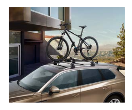
Bicycle holder* For bicycle frames of up to 100 mm (oval)/80 mm (round)