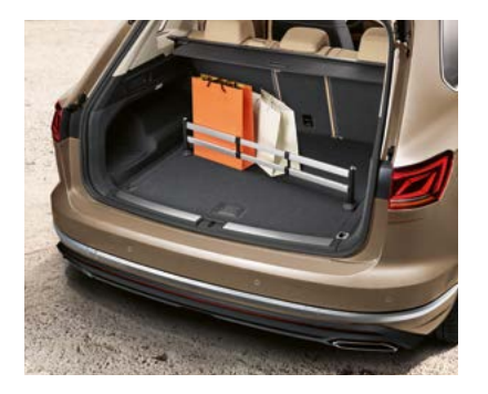
Cargo liner Luggage compartment plug-in module