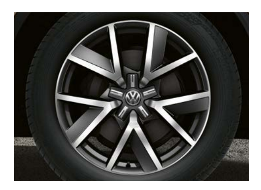
"Braga" 20" Alloy (Standard on Executive)