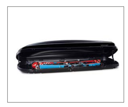
Roof box Comfort, 460 litres, high-gloss black