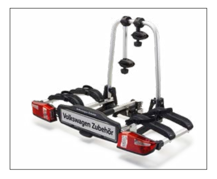
Bicycle carrier for the towing hitch 2 bicycles, folding, Compact III