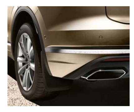
Mud flap Rear

The new Touareg has arrived and is the most technologically and visually progressive SUV from Volkswagen to date. It's a luxury vehicle that offers you accessories that enable you to have your personal taste and style reflected, inside and out, and caters to meet your practical needs as well.