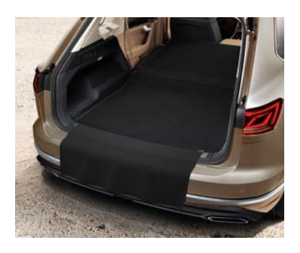
Boot mat - reversible Velour/plastic nubs