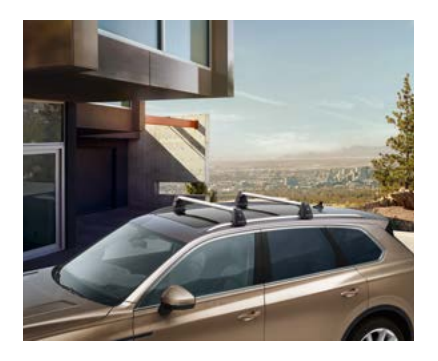
Supporting rods T-groove, Aero profile